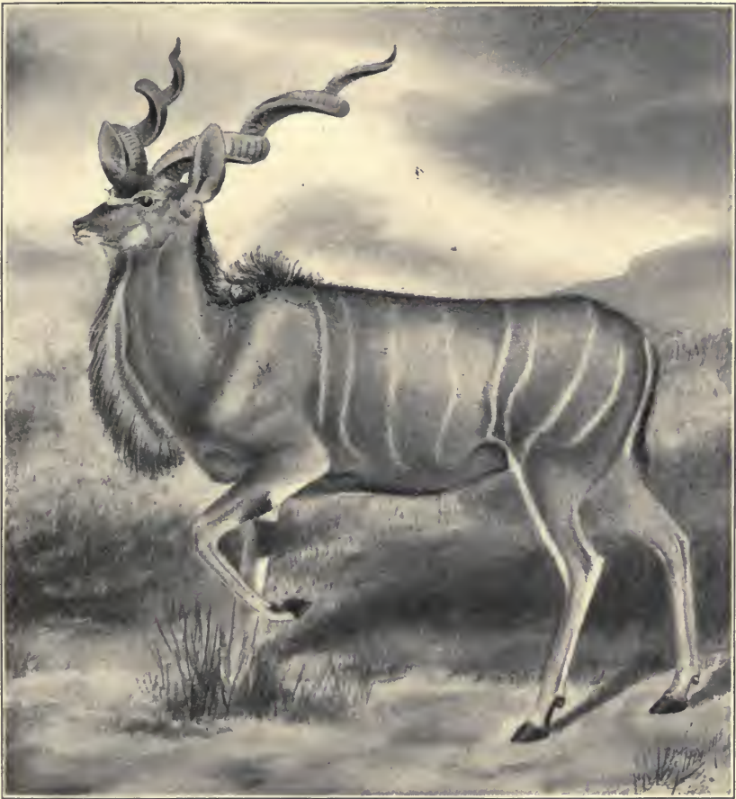
FIG. XX. STREPSICEROS STREPSICEROS. GREATER KUDU.

4-7. Adult ♀ Coll. Mandera, Somaliland, E. Africa. D. G. Elliot.